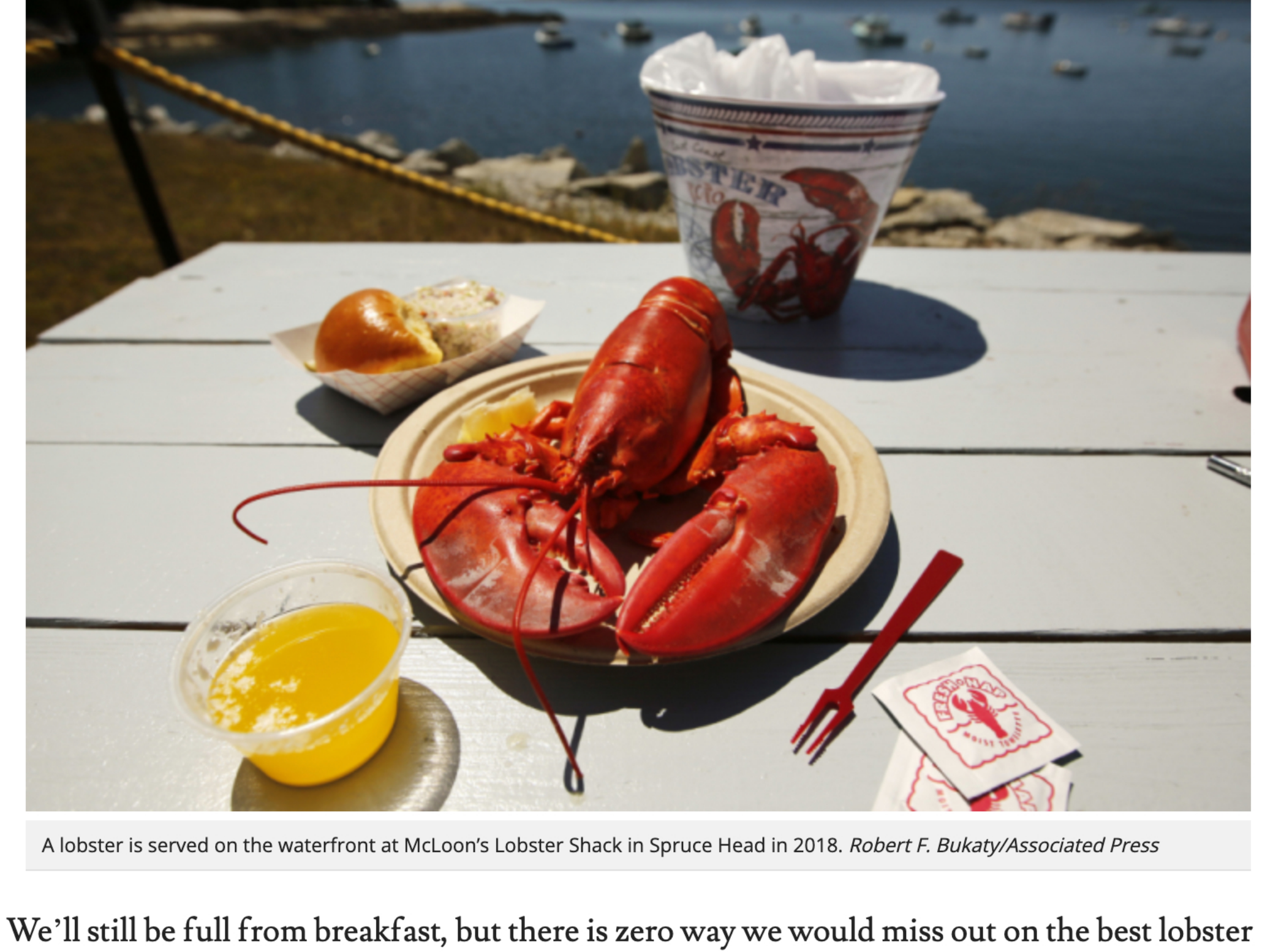
A lobster is served on the waterfront at McLoon's Lobster Shack in Spruce Head in 2018.

Next stop: Freeport, where I will browse the racks at ReStyle Consign , my favorite consignment shop. I will leave with armfuls of vintage apparel and accessories – hey, it’s a hobby, not an addiction! From Freeport, we will head to Camden, where we will work off breakfast, hiking up Maiden’s Cliff Trailhead . The hike will rev up our muscles, and the panoramic views of Penobscot Bay will rev up our souls. Since we will also want to rev up our brains, we’ll make a pit stop at the Owl & Turtle Bookshop & Cafe and see if we can’t find a favorite new Maine author or two, then start diving into the books we purchase in the upstairs reading room.