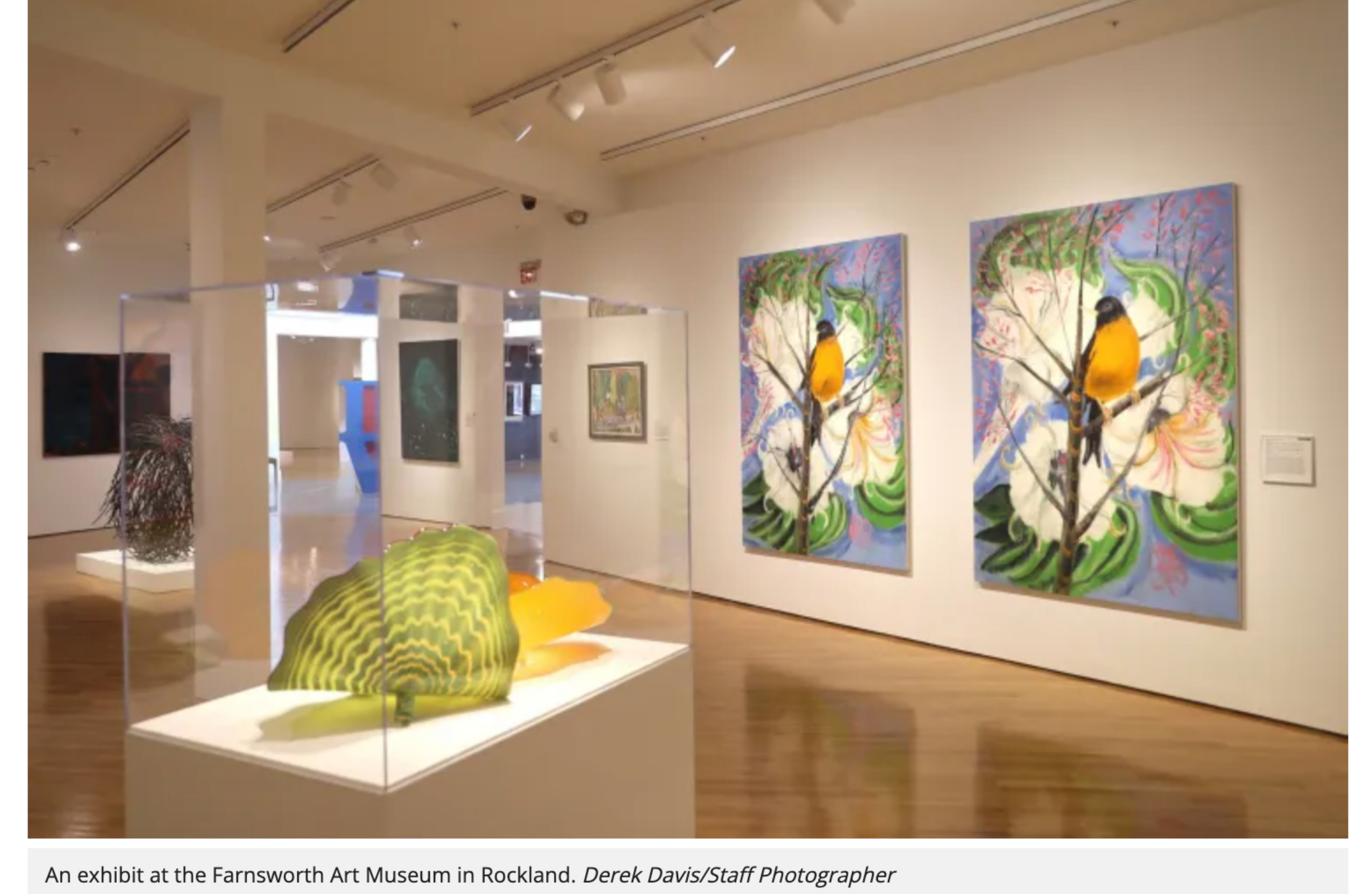
An exhibit at the Farnsworth Art Museum in Rockland.

We’ll still be full from breakfast, but there is zero way we would miss out on the best lobster rolls on the planet at McLoons Lobster Shack in South Thomaston, served oceanside ... and then there is the best dessert on the planet at McLoons, the blueberry bread pudding with handmade blueberry ice cream (think blue-ribbon Grandma baking on steroids).