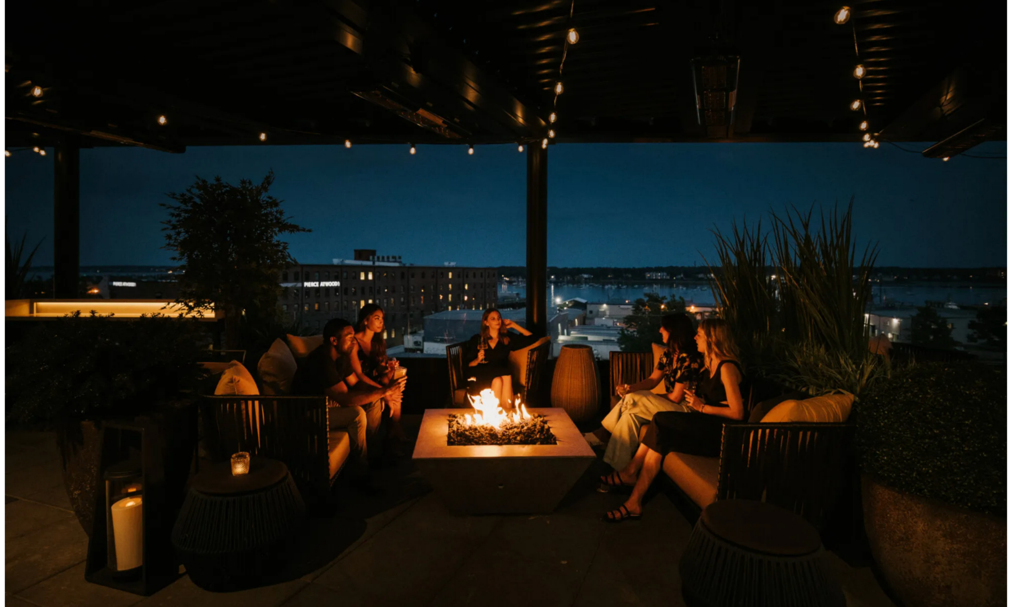
Luna Rooftop Bar, at Canopy by Hilton in Portland, is the perfect spot for a nightcap.

Just because we’re stuffed doesn’t mean we won’t go for the vegetarian tasting menu at the kitchen counter at Evo Kitchen + Bar in Portland for dinner, where the balletic performance of chefs, bartenders and servers in harmony in a two-by-nothing space is as mind-boggling as the food and drink. We’ll then indulge in a film at Apple Cinemas in Westbrook, where the fully reclining movie seats alone make the experience. A nightcap at Luna Rooftop Bar at the Canopy by Hilton in downtown Portland will be the perfect ending to the perfect day!