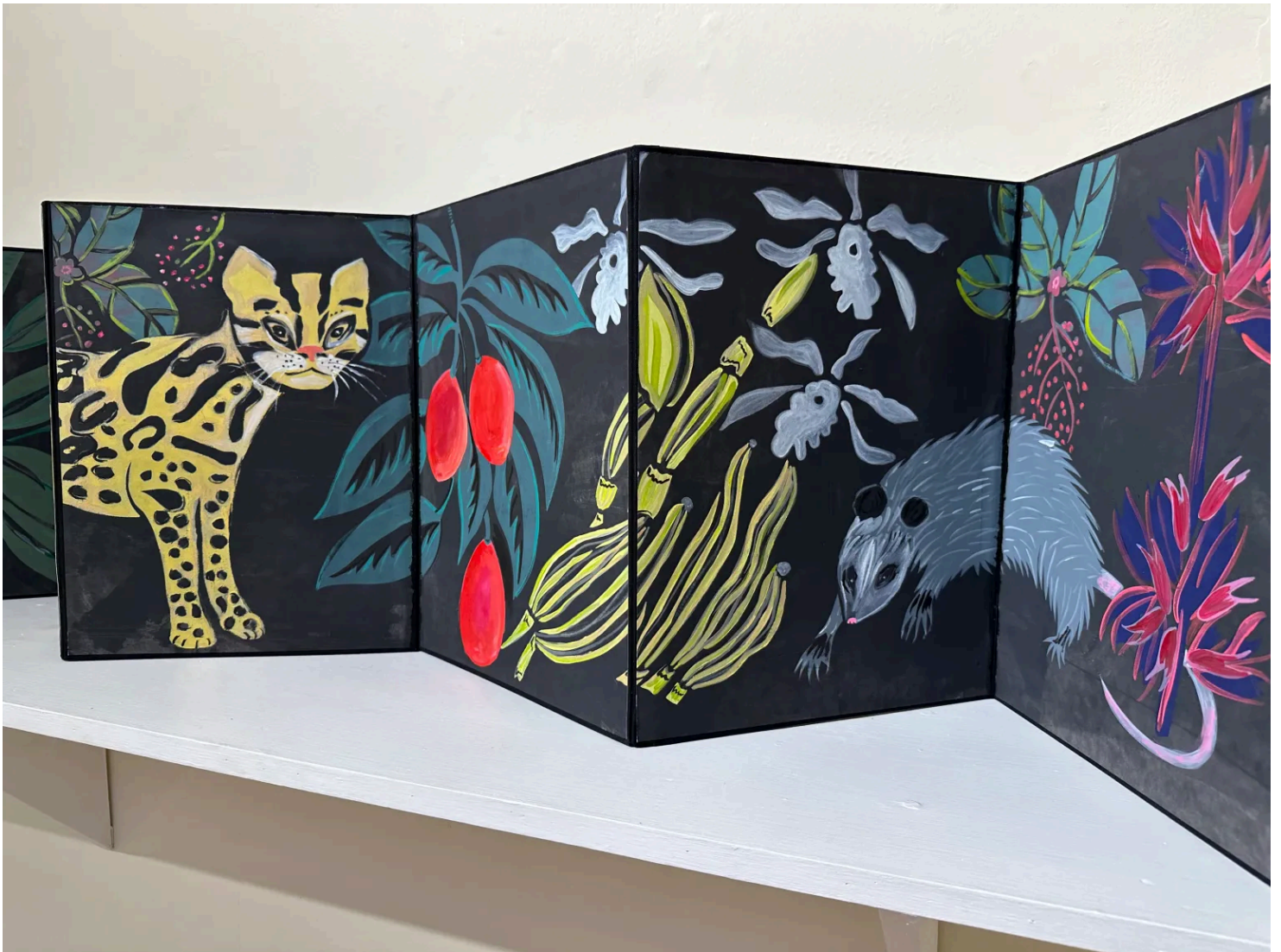
Rebecca Goodale, "Ocelot and Opossum."

Solarplate etching involves polymer-coated light-sensitive steel plates that are exposed to UV rays and water for developing, while collagraph is a kind of embossing technique. The former, reads the explanation in the binder, "effectively replac[es] hazardous acids and solvents with an environmentally friendly process that allows for fine detail and tonal variation." This detail and tonal variation is evident in the rendering of the baskets in each piece, while collagraph adds dimensionality to ribbons of color that bisect the prints and intertwine around the baskets.