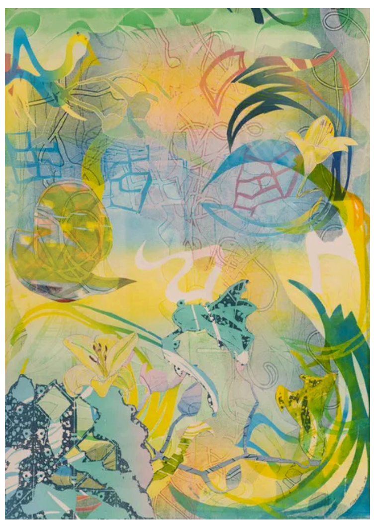
Ellen Roberts, "Sal's Garden."

Ellen Roberts's work are also monotypes (meaning one-offs) where she has printed images, then collaged forms atop them and, in some, stitched the works before running them through the press. The colors are unabashedly beautiful, and the multistep process can be followed more closely here than in other works in the show because they represent self-evident elements (i.e.: the cutouts collaged onto the paper, the stitching are clearly discernible on their own). "Butterfly Sail" is particularly beautiful, though hung too high in this show to really spend time with it because we have to crane our necks upward and almost squint to behold the incredibly minute details.